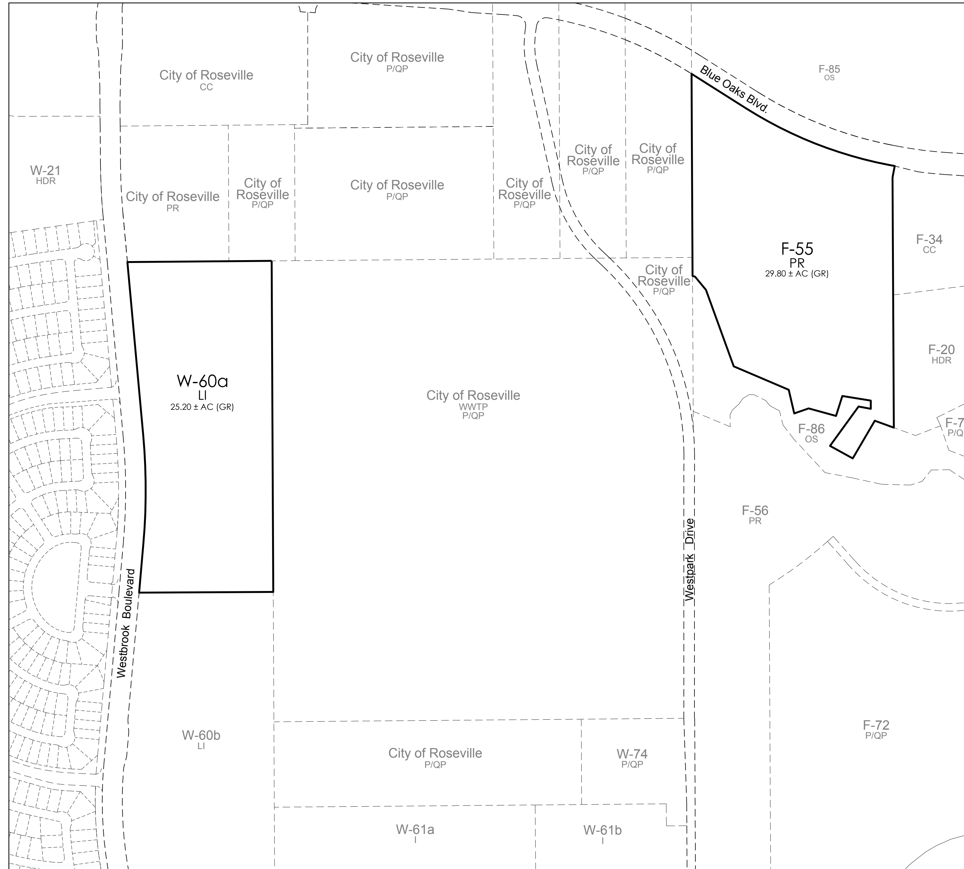
EXISTING LAND USE